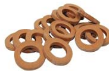
Garden Hose Washers