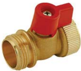
Garden Hose Valve